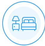
Lodging and Accommodation Expenses